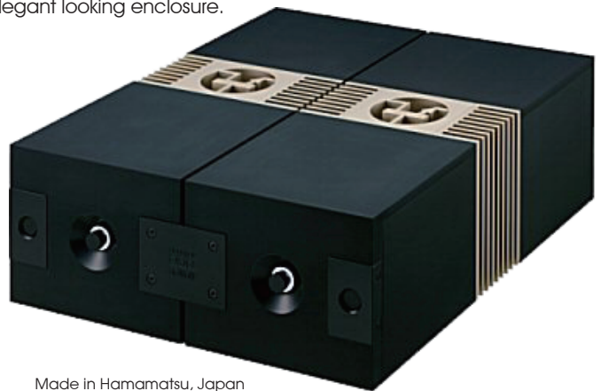
Made in Hamamatsu, Japan Stereo Bridged B-1a amplifiers, physically joined by optional chassis coupling brackets.

Each B-1a can be configured as a 'mono' Bridge (BTL) amplifier, thus increasing power output. A pair of B-1a can be physically coupled to form a single elegant looking enclosure.