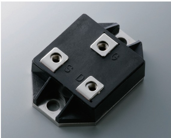
Static Induction Transistor, output: 2SK77B

By utilizing our very own manufactured semiconductors (SIT) we have designed and produced an amplifier with outstanding sonic qualities.